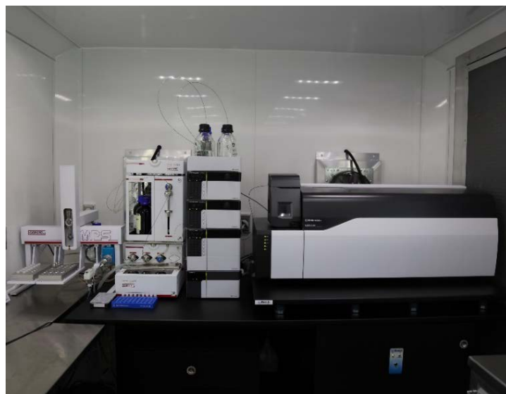
Shimadzu Model 8050 LC/MS/MS

In conjunction with Cascade's high resolution site characterization tools and techniques (such as WaterlooAPS, COREDFN, drilling and direct push), our PFAS MobiLab services provide our clients with the ability to efficiently and effectively characterize PFAS sites in a single mobilization.