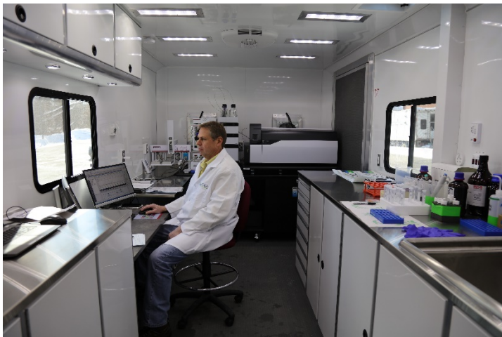
PFAS Mobile Laboratory in Action

We can also augment PFAS analyses with NELAP-accredited sample analyses for volatile organic compounds (VOCs) and semi volatile organic compounds (SVOCs) for complex contaminant mixtures such as those found at firefighting training areas at DoD sites.